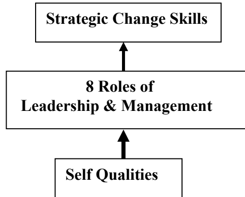
Diagram 1: Key Domains of Leadership & Management

A model of the skills and competencies of wise leaders would involve self, leadership and management as well as strategic skills needed by a leader to fulfill the organisation's change directions at that time. This is represented in the following diagram: